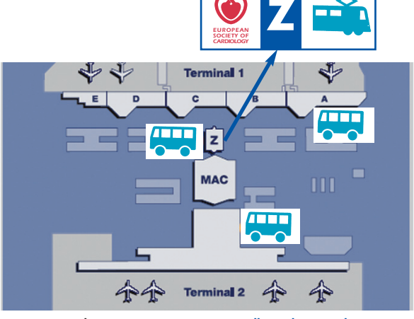
MAC: Munich Airport Centre — Z: Zentralbereich (central area)