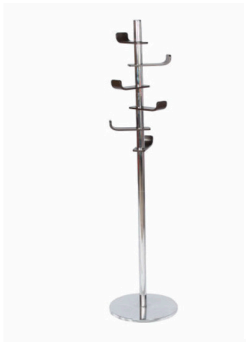
064 COAT RACK CHROME