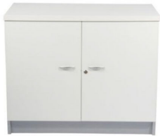
053 STORAGE CABINET WHITE