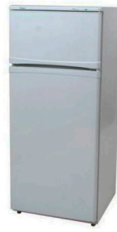
070 BIG REFRIGERATOR