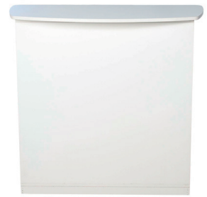
176 COUNTER AND STORAGE WHITE