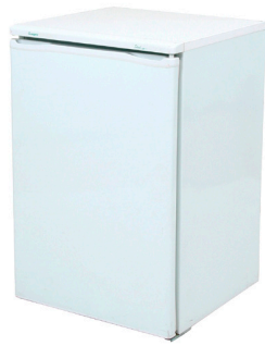
069 SMALL REFRIGERATOR