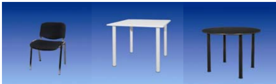
Table Top Package (SP 02)