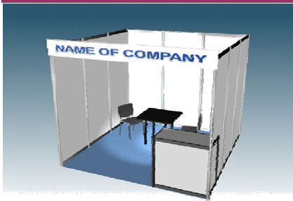
Pre-fitted stand package (SP 01)