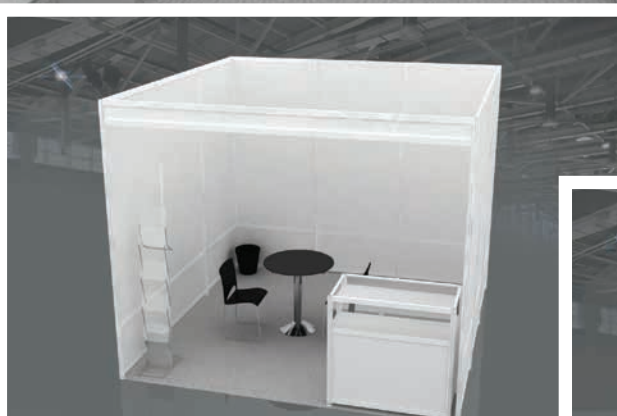
Stand Package A