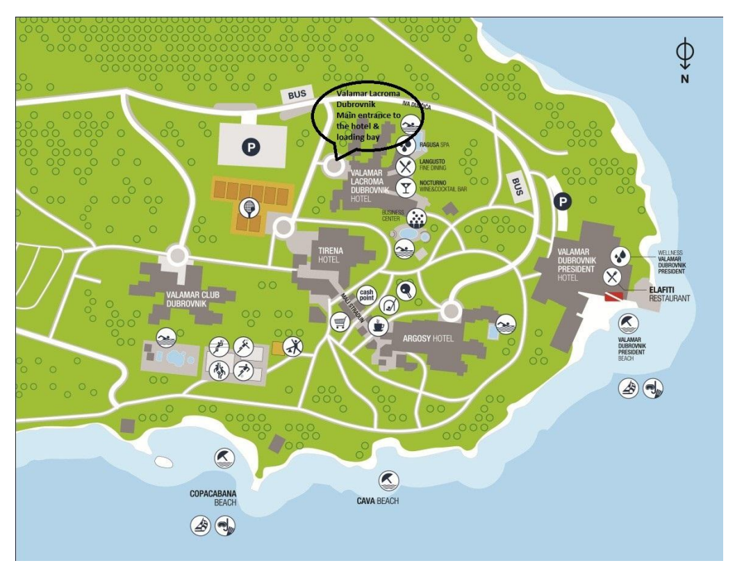
Babin kuk Map