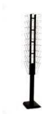
Brochure Rack 1506