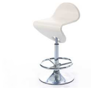
"Nox" Bar stool 1073