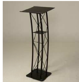
"Tower" Computer Table 1255