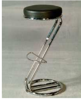
Bar stool 1061