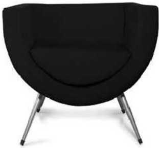
"Peace" Lounge Chair 1083