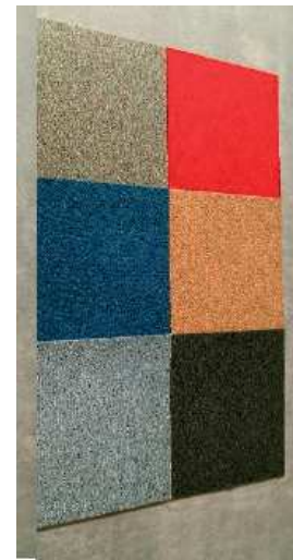
Boucle carpet tile 8510: RED 8520: TAN 8530: COKE GREY 8540: GREY 8550: BLUE 8560: LIGHT BLUE