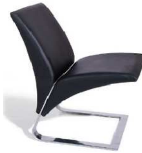
"Leaf" Lounge Chair 1085