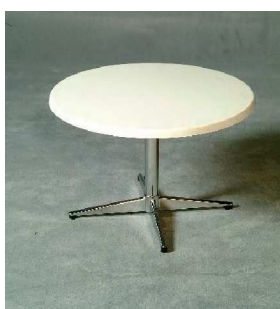
Coffee Table 1210

*Reminder : as per ESC Guidelines, all stands must be carpeted entirely