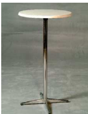
High Table 1290