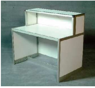
Information Desk 1420