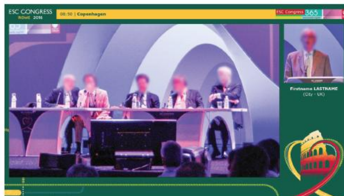
Simultaneous view: Wide shot of chairpersons & speaker

After the congress, the ESC will provide video files for each presentation from the webcast in the timeliest manner after the congress. Should you wish to acquire raw footage, this needs to be requested, prior to the congress, by contacting CYIM and set up before the congress commences. This will be invoiced by CYIM accordingly: DEADLINE to order raw footage of the session: 29 June 2018