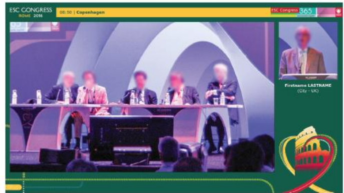
Simultaneous view: Wide shot of chairpersons & speaker

After the congress, the ESC will provide video files for each presentation from the webcast in the timeliest manner after the congress. Should you wish to acquire raw footage, this needs to be requested, prior to the congress, by contacting CYIM and set up before the congress commences. This will be invoiced by CYIM accordingly: DEADLINE to order raw footage of the session: 30 JUNE 2017