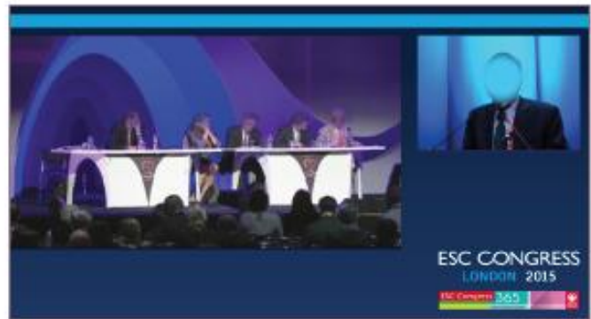
Simultaneous view: Wide shot of chairpersons & speaker