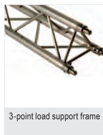
3-point load support frame