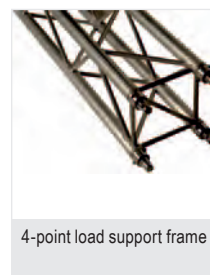
4-point load support frame