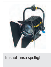
fresnel lense spotlight