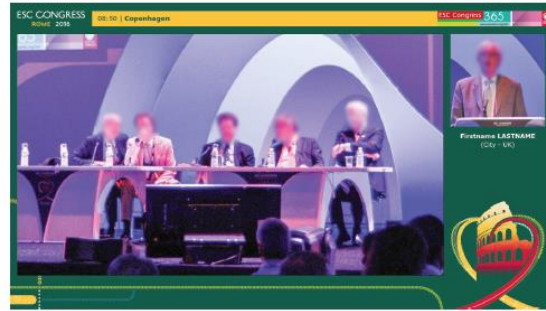
Simultaneous view: Wide shot of chairpersons & speaker

After the summit, the ESC will provide video files for each presentation from the webcast in the timeliest manner after the summit. Should you wish to acquire raw footage, this needs to be requested, prior to the summit, by contacting CYIM and set up before the summit commences. This will be invoiced by CYIM accordingly: DEADLINE to order raw footage of the session: 25 September 2019