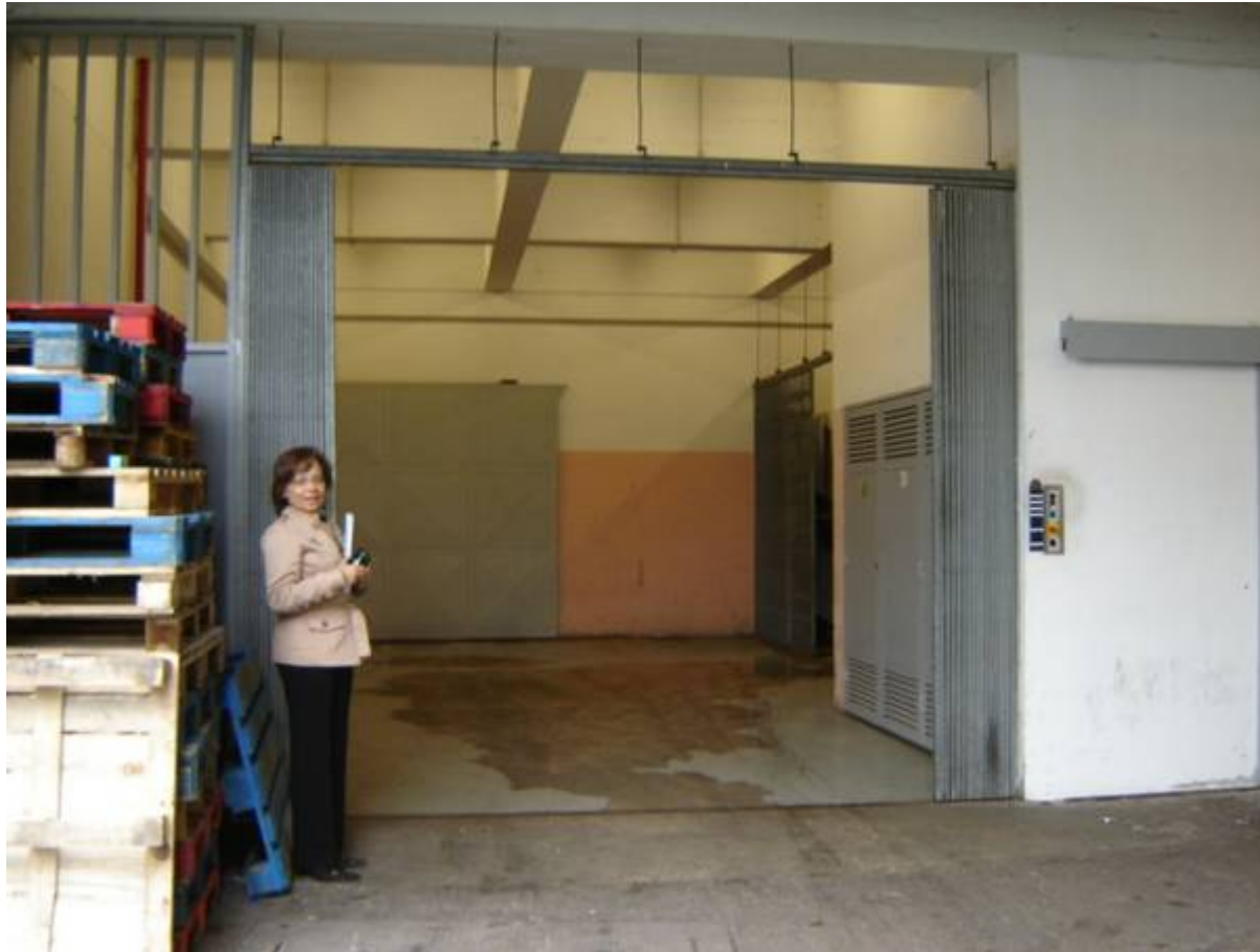
Loading Bay entrance with direct access to the Learning Village Area