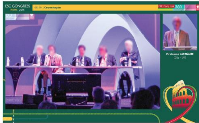
Simultaneous view: Wide shot of chairpersons & speaker

If you wish to acquire “raw footage” (uninterrupted filming of the session), or have your Session in different languages: you must inform our supplier CYIM prior to the congress, CYIM will ensure to set up the room accordingly. Services will be invoiced by CYIM DEADLINE: 23 February 2018