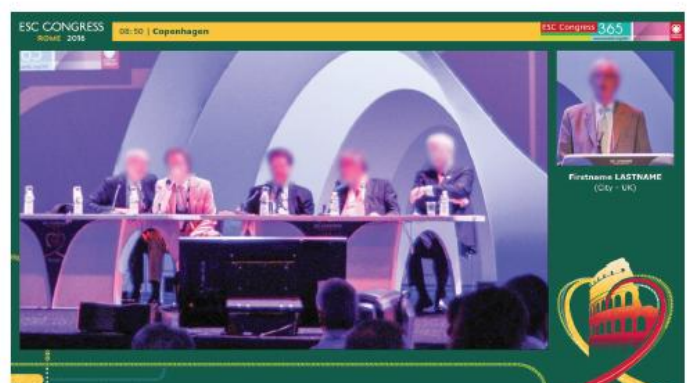
Simultaneous view: Wide shot of chairpersons & speaker

Should you wish to acquire raw footage, this needs to be requested prior to the congress, by contacting CYIM and set up before the congress commences. This will be invoiced by CYIM accordingly: DEADLINE to order raw footage of the session: 1 March