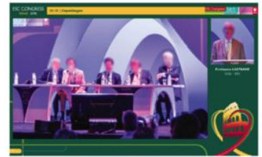
Simultaneous view: Wide shot of chairpersons & speaker

If you wish to acquire raw footage, this needs to be requested, prior to the congress, by contacting CYIM and set up before the congress commences. This will be invoiced by CYIM accordingly: Deadline to order raw footage of the session: 10 January 2018