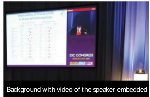
Background with video of the speaker embedded

The webcast is recorded as 1 video per presentation, not as 1 video for the entire session. To acquire raw footage you must order this to our supplier CYIM before the deadline: 10 January 2018 . The company CYIM will invoice extra accordingly.